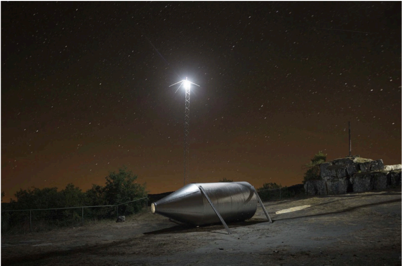
Station Radio by French artist Thomas Lasbouyges. We transmitted an FM artists' radio station during the exhibition Exoplanet Lot.