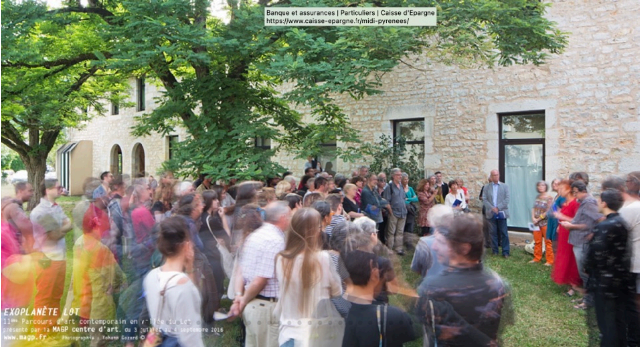
The public gathers for the opening of Exoplanet Lot.