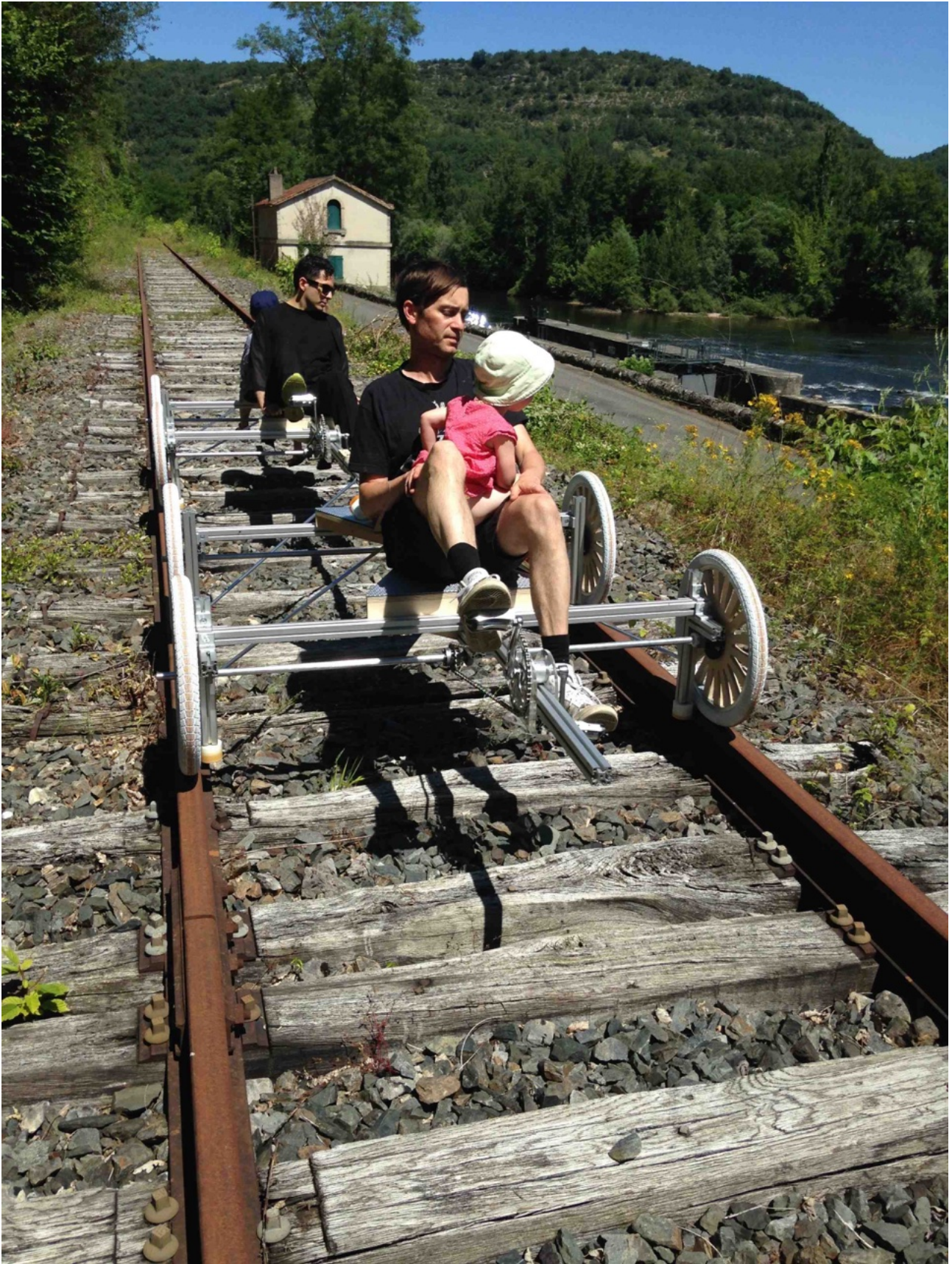
Centipede, an artist-developed ecotrain by the French group HeHe, which travelled the length of the Lot Valley, accessible by the public.